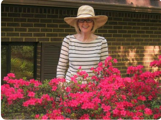
Stella and Azaleas 2014